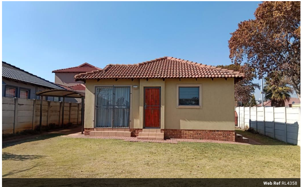
Web Ref RL4358