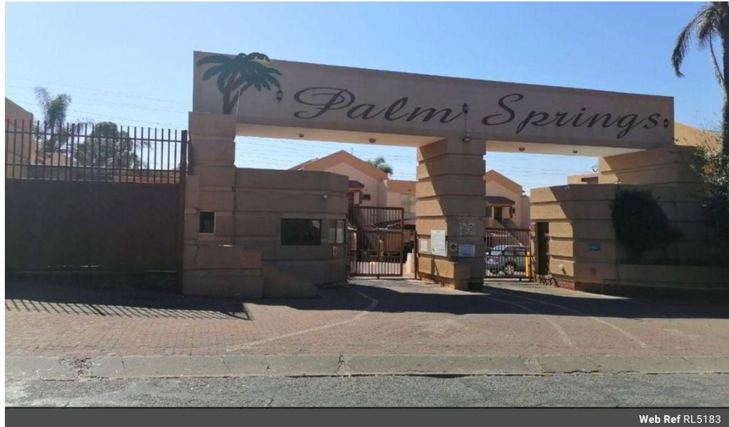
Web Ref RL5183