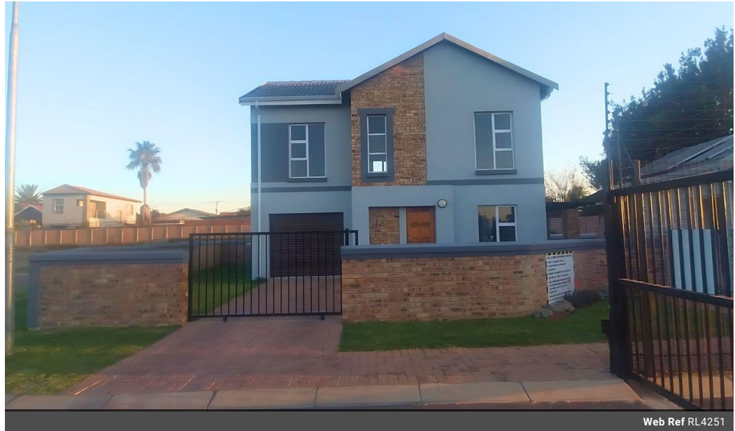
Web Ref RL4251