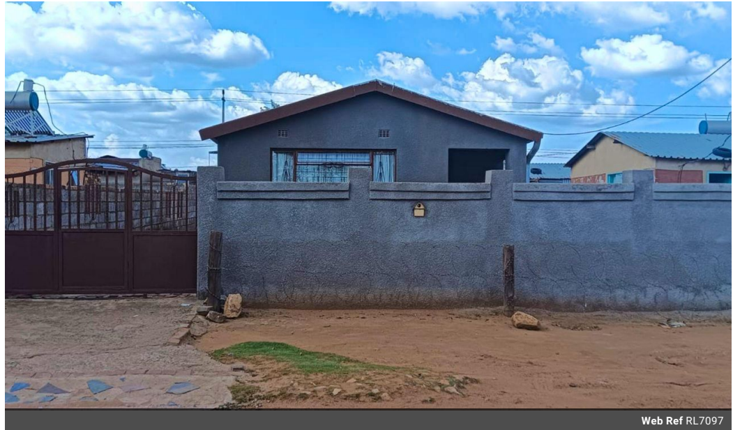
Web Ref RL7097