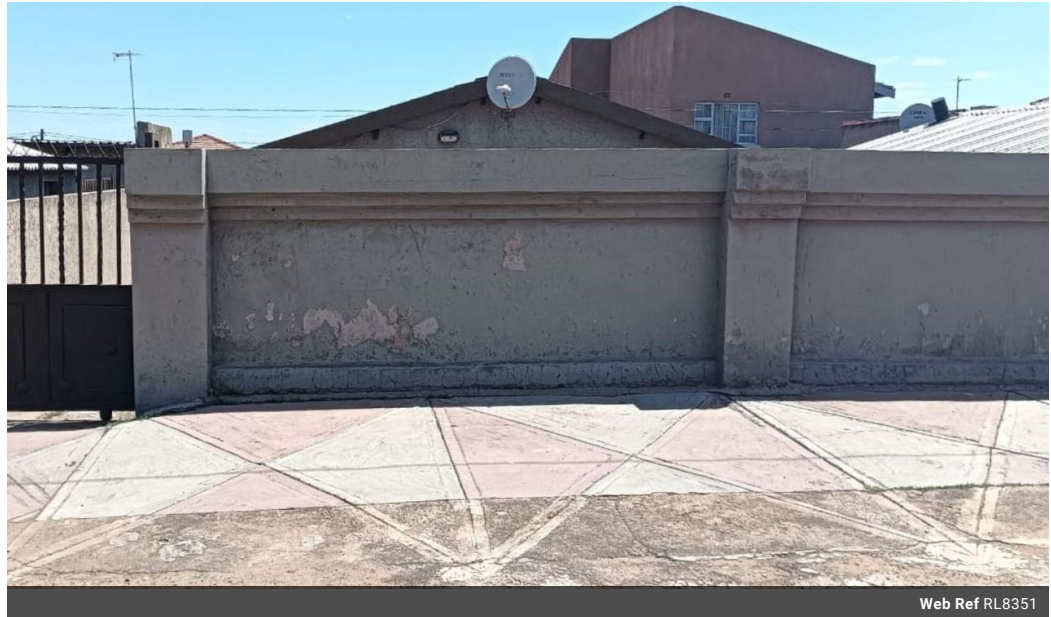
Web Ref RL8351