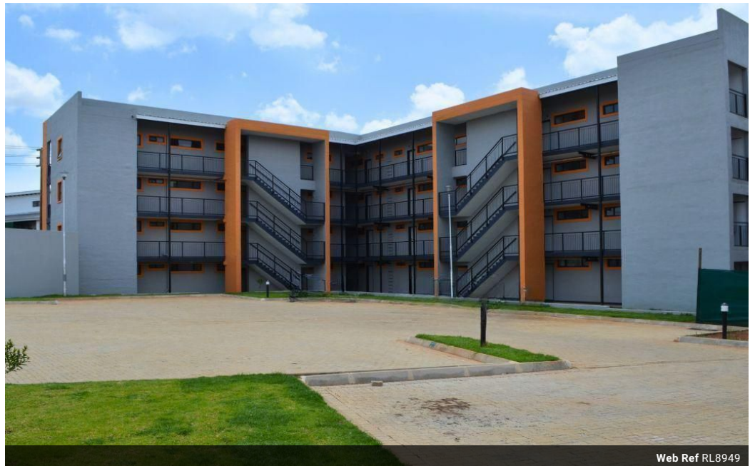
Web Ref RL8949